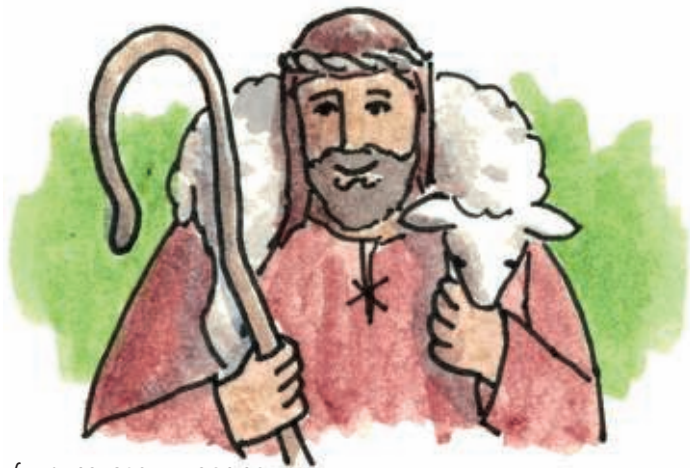
Solution: I have found my lost sheep.