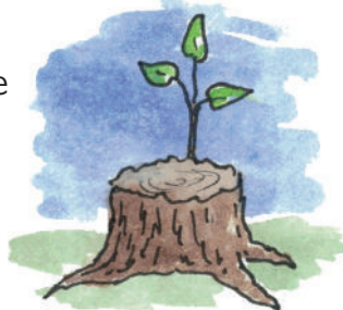
Isaiah 11: 1-10

Not by APPEARANCE shall he JUDGE , nor by HEARSAY shall he decide, but he shall judge the POOR with justice, and decide aright for the land's AFFLICTED . He shall strike the RUTHLESS with the ROD of his mouth, and with the breath of his lips he shall SLAY the wicked. JUSTICE shall be the BAND AROUND his waist, and FAITHFULNESS a belt upon his hips.